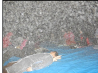
The group begins the contact work in the quantum fabric