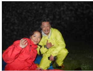
The site just before the "fog" came

As we began to set up our gear in the field, we could not believe our eyes. A dramatic "fog" began rolling in. It was becoming so thick in patches that we could barely see a foot in front of us.