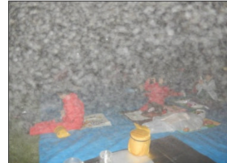
The quantum fabric became even thicker after we stopped taking photos