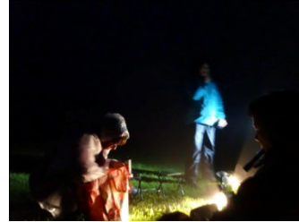
Setting up at the site, before the arrival of the "quantum fabric"

As we began to set up our gear in the field, we could not believe our eyes. A dramatic "fog" began rolling in. It was becoming so thick in patches that we could barely see a foot in front of us.