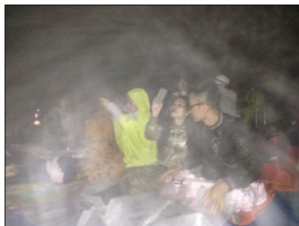
As the quantum fabric rolled in, a sense of eeriness was felt. The Hong Kong group began taking photos