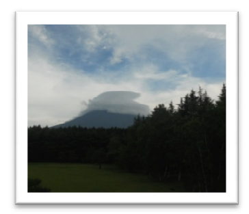
(3) After a visit to the shrine - the lenticular clouds begin growing over Fuji-san

The next morning those lenticular clouds over Fuji got heavier and more dense. The group of about 25 students arrived at around noon and we began the workshop at 1:30pm. We could still definitely feel the acceleration and intensification of the energy and it was apparent by watching the state of the group, because they began to display the telltale signs: spaciness, "sugar high," energy headaches, and a sense of overwhelm at the accelerated energy sensations they were feeling. Jackpot! From all those signs, it seemed that it would be a powerful experience indeed.