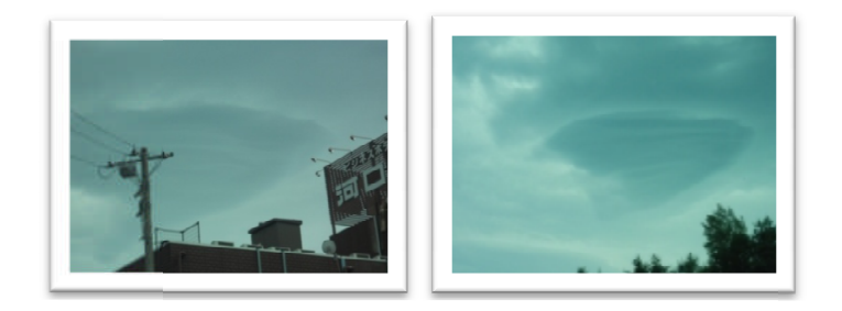
(1) Left: When we first noticed the cloud from the bus / Right: The same cloud from the hotel, about an hour later

As we got closer to the disembarkation point at Fujiyoshida, we noticed the eerie mothership-shaped cloud that hovered in the sky and never moved. We began photographing it from the bus. (Contrary to what some may think, the appearance of these kinds of clouds doesn't always happen in this area, and as you will see, was a constant presence during the retreat. Once the retreat ended, the clouds dissolved!)