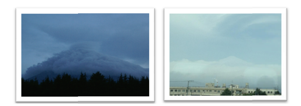
(5) Left: The vortex builds over Fuji, just as Sasha discussed, right before our outdoor contact work. This photo was taken from our location, on the Yamanashi (north) side of Mt. Fuji. Right: Unbeknownst to us, a student of mine was on the bullet train on the Shizuoka (south) side of Mt. Fuji, and took a photo during the same afternoon. Note the mothership-shaped cloud in upper right corner.

We took a break for dinner and the energy was high with anticipation. For some, this was their first experience of contact work and they didn't know what to expect. For the many repeating students, they couldn't wait to see what would happen this year. Around 7:30pm we boarded the bus and took the short ride to the contact site. As usual, we set up large plastic tarps and got ready for rain, even though there were no rain clouds in sight. After the group settled in, we began the session.