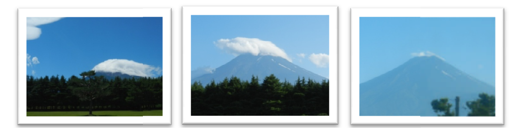
(7) Left: Sunday Morning / Center: Lunch time Sunday / Right: End of the workshop in late afternoon